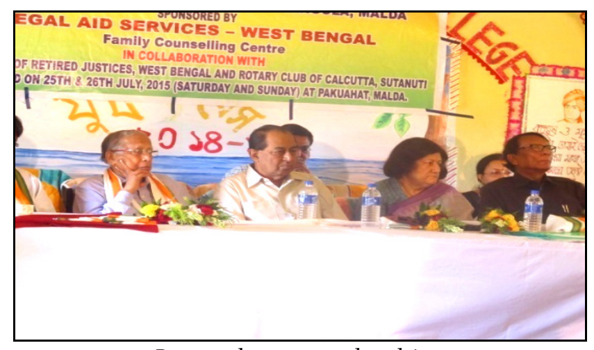
Respected guests seated on dais.