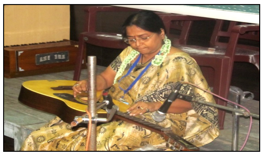
Guitar performance by one of the students