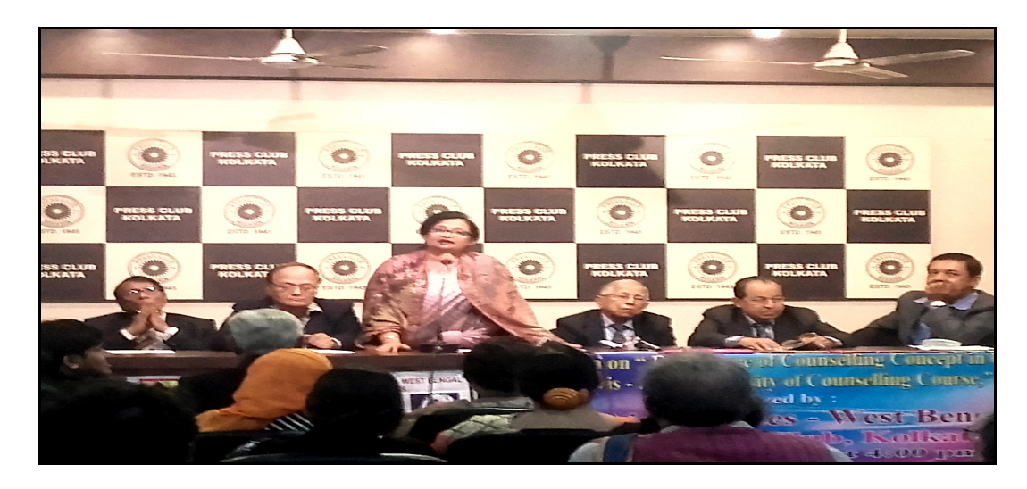
Smt. Chandrima Bhattacharya , the then Hon'ble Minister of State, Law and Judicial Affairs, Govt. of West Bengal is addressing on the subject of "Emercence of Counselling Concept in our society vis-à-vis necessity of Counselling course" at Press Club , Calcutta